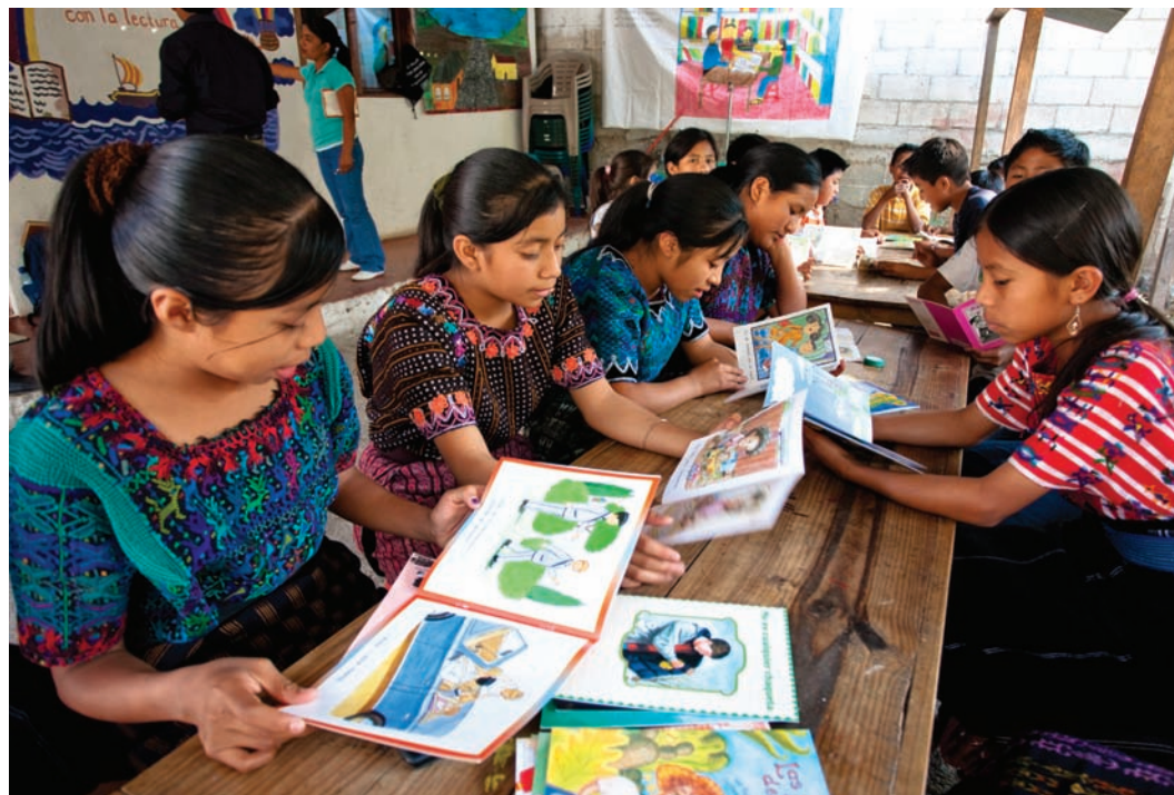
Girls read recently donated books at a library's outdoor tables in the province of Sololá.