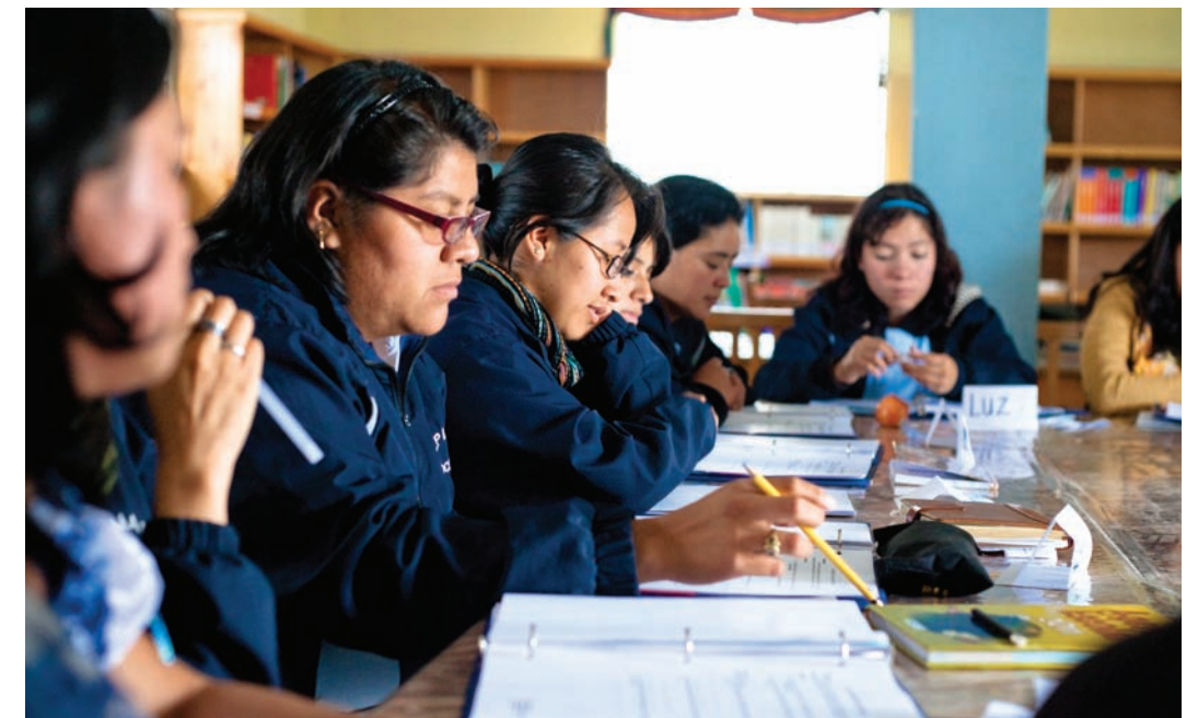
Teachers participating in a Child Aid literacy training session in the town of Chimaltenango.