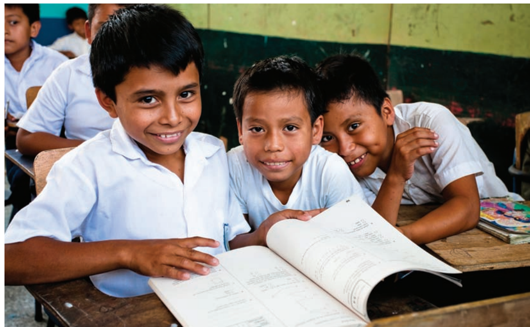
These boys in the village of Chicacao received new textbooks and storybooks in 2010 and have access to hundreds more in the Child Aid-sponsored community library.