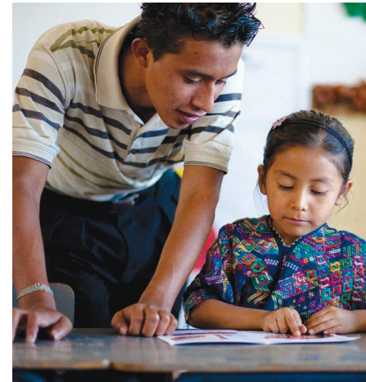
A teacher in Sololá, now in his first year of our training program, helps a Mayan girl with reading.